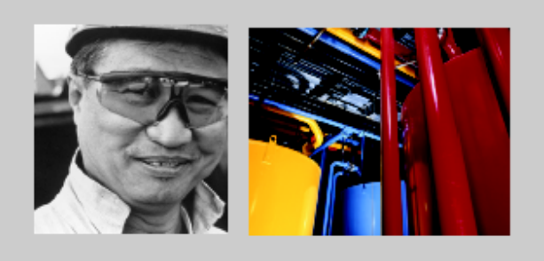
XARUMARAHA SUNTA WAXEY WAANO KU SAABASAN KA HORTEGIDDA IYO DAWEYNTA SUNTA KIIMIKADA KA BIXIYAAN GOOBTA SHAQADA.