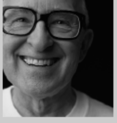
HADDII AY UBADKU FARAHA LA GALAAN ALAABTA GURIGA LAGU NADIIFIYO, TELEFOON U DIR XARUNTA SUNTA.